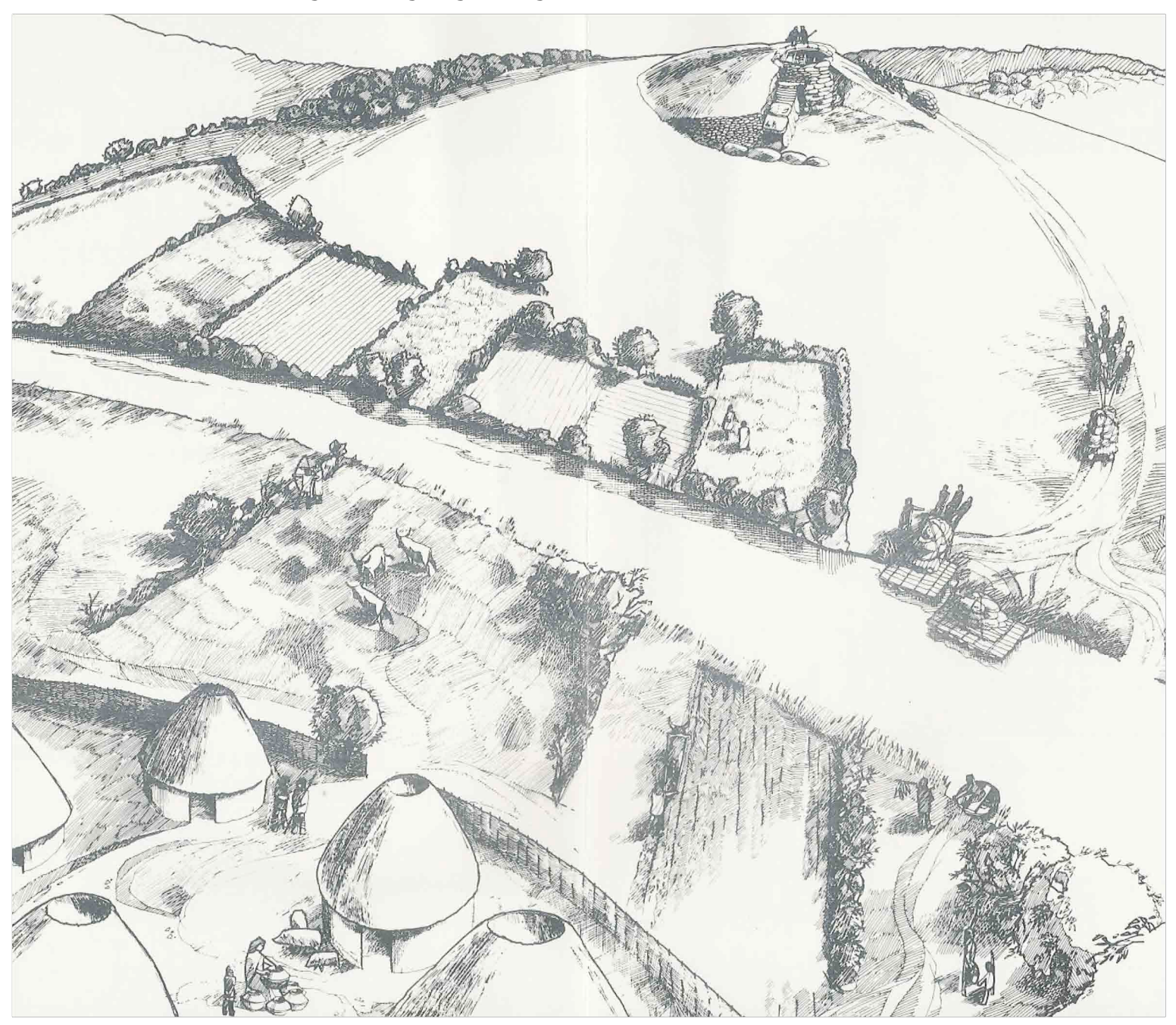
Draw the Newgrange Entrance Stone

Colour in this drawing of Newgrange being built